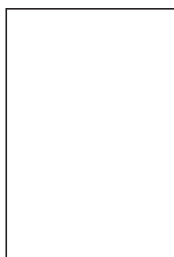
Dalena Khothsombath (Pi-St) 506-6523